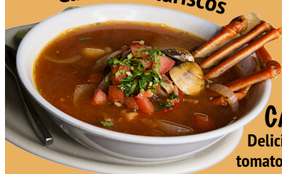
Caldo de Mariscos